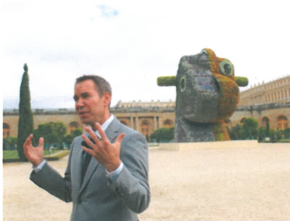
Above: Jeff Koons in front of his "Split-Rocker" (2000) as it graces the famous Palace and Gardens of Versailles.

American Artist Jeff Koons -whose work is being called everything from pop, kitsch.. even zany by the press-- is displaying 17 of his pieces (almost all recent works from the 80s until now) at the Chateau de Versailles (aka Palace of Versailles) from September 10th through December 14th.