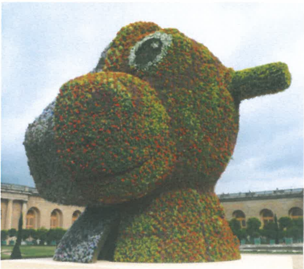
Above: "Split Rocker" (2000)